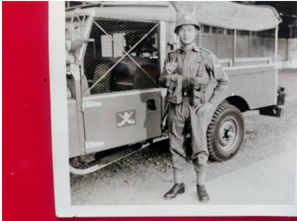
A young Kong Ming