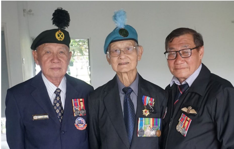
Three of the four recipients of the PJM, standing proudly with their medals

In 2004, the Government introduced a medal, the Malaysian Service Medal or Pingat Jasa Malaysia. This medal was to recognize service by the members of the Malaysian Armed Forces during the First and Second Emergencies and the Indonesian Confrontation. This medal was also awarded to Commonwealth forces who served in Malaysia. The award is in recognition of distinguished chivalry, gallantry, sacrifice, and loyalty in contributing to the freedom and independence of Malaysia. (Source: Wikipedia) We are proud to announce that all four of the 10th KL boys featured here were awarded this prestigious medal. To these four individuals, 10th KL salutes you for your gallantry and selflessness in providing assurance and protection to the nation.