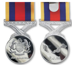
The Pingat Jasa Malaysia

NOTE: It may well be that there are more individuals from 10th KL who have served in the military and received similar recognition. We welcome details of such individuals to be highlighted here.