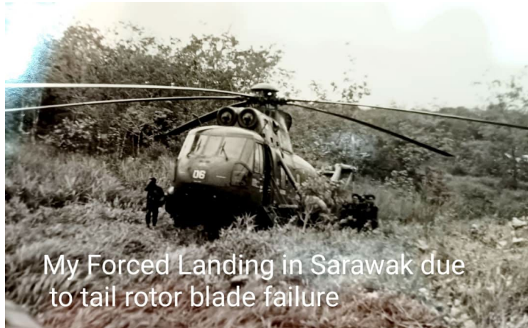
Broken tail rotor